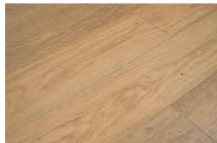
Authentic Oak HL7606