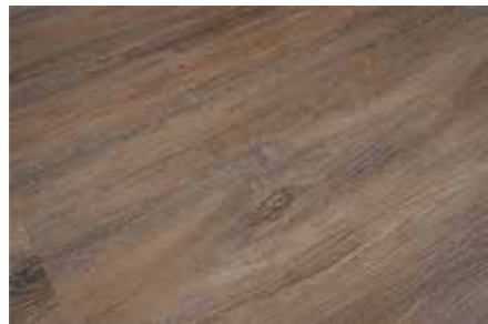
Dark Oak ER1605