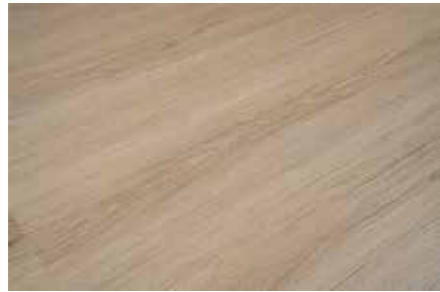
Light Oak OP502